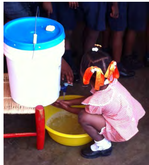
Little girl learning to wash her hands