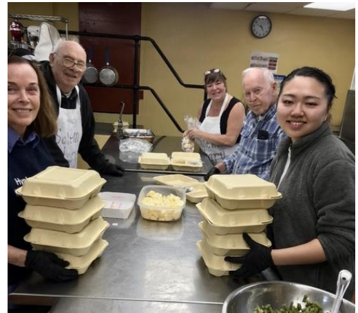
Above, Salem Rotarians prepare take-out ham dinners for its Salem/Shushan Fuel Fund Raiser.