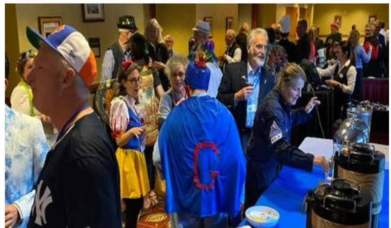
2022 District 7190 Conference Event