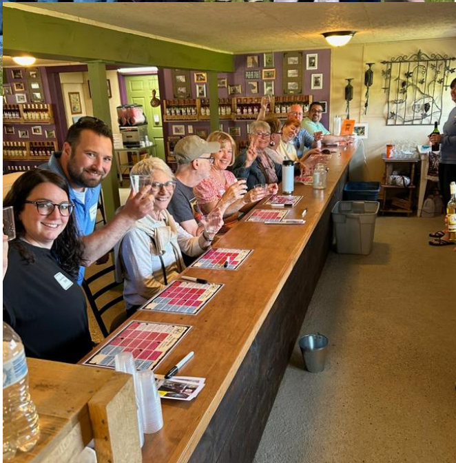
Hummingbird Farms Winery